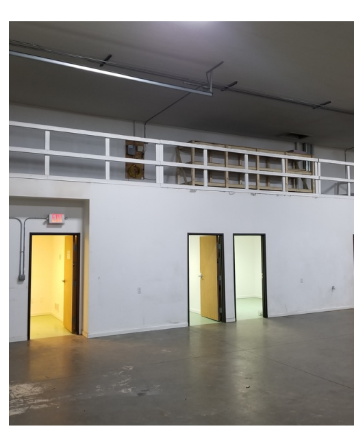
ADDITIONAL PHOTOS PAGE 5