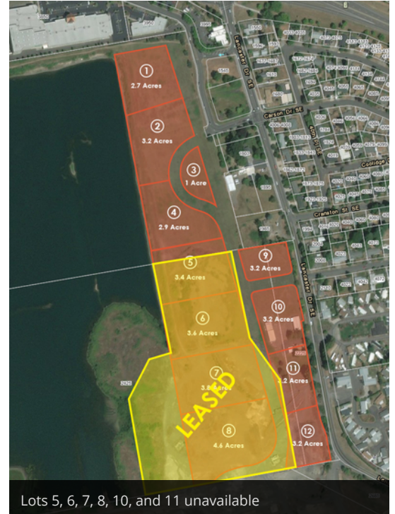
Lots 5, 6, 7, 8, 10, and 11 unavailable