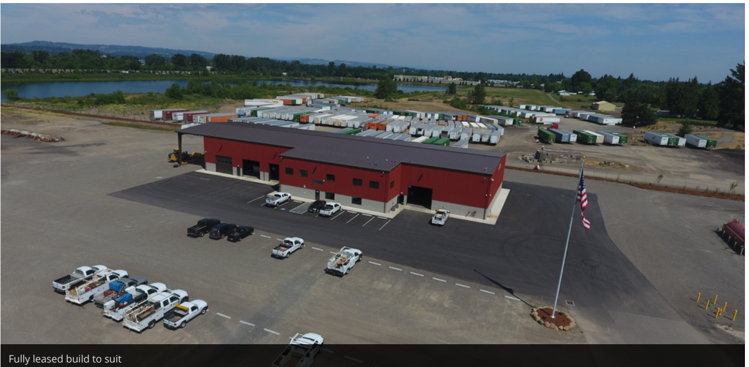
Fully leased build to suit