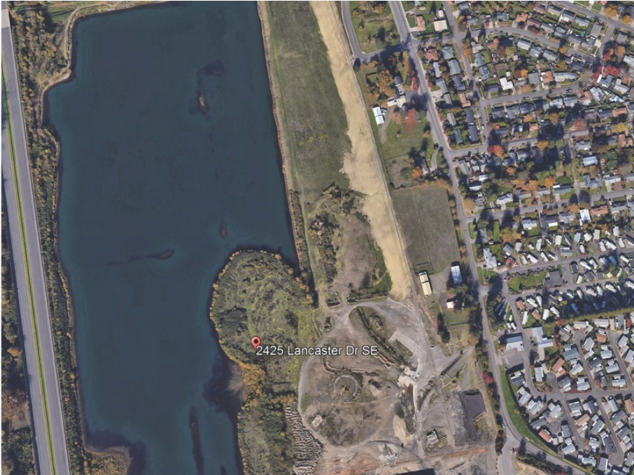
Bare land available to lease or custom build to suit tenant needs

Build to Suit Opportunity 2225-2685 Lancaster Dr SE, Salem, OR 97301