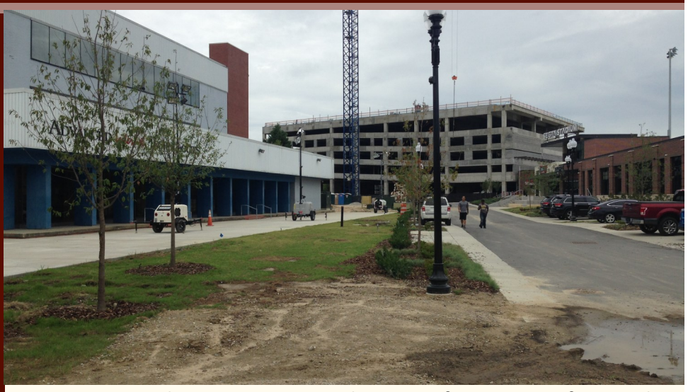
New Patio—Adjacent to Segra Stadium—Perfect Location for Retail Space!