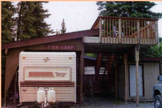
30' TRAILER ON COMMERCIAL IMPROVED LOT