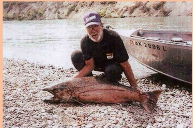
$139,900. OR EXCHANGE FOR INCOME PROPERTY