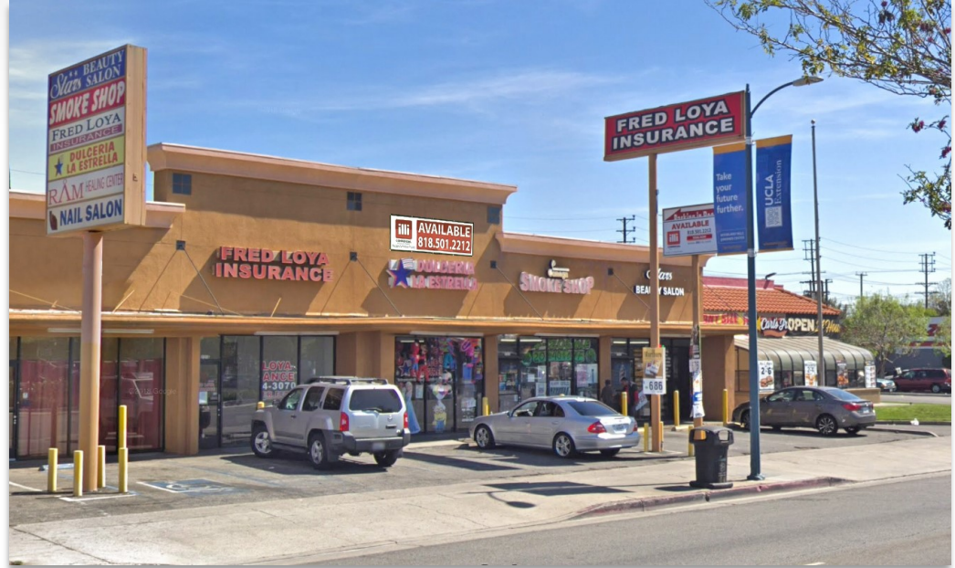
Great visibility on Sherman Way

This information has been secured from sources we believe to be reliable, but we make no representations or warranties, expressed or implied, as to the accuracy of the information. References to square footage are approximate. References to neighboring retailers are subject to change, and may not be adjacent to the vacancy being marketed either prior to, during, or after leases are signed. Lessee must verify the information and bears all risk for any inaccuracies.