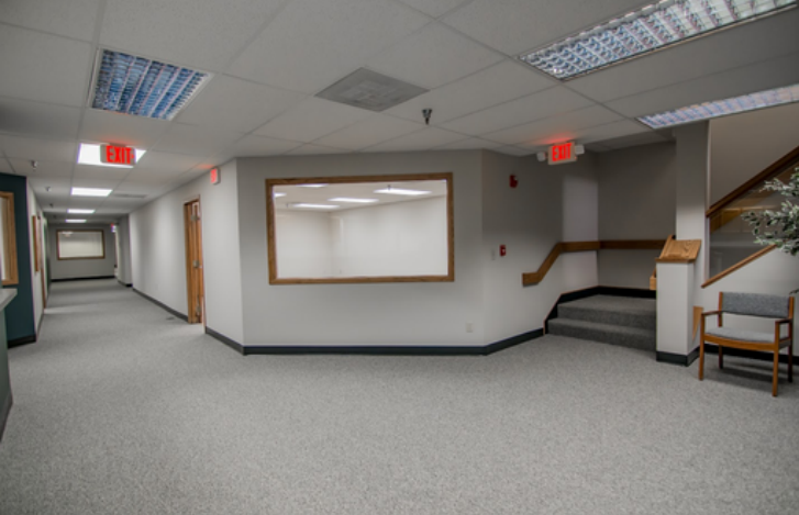
KW COMMERCIAL 2401 W. Main Rapid City, SD 57702