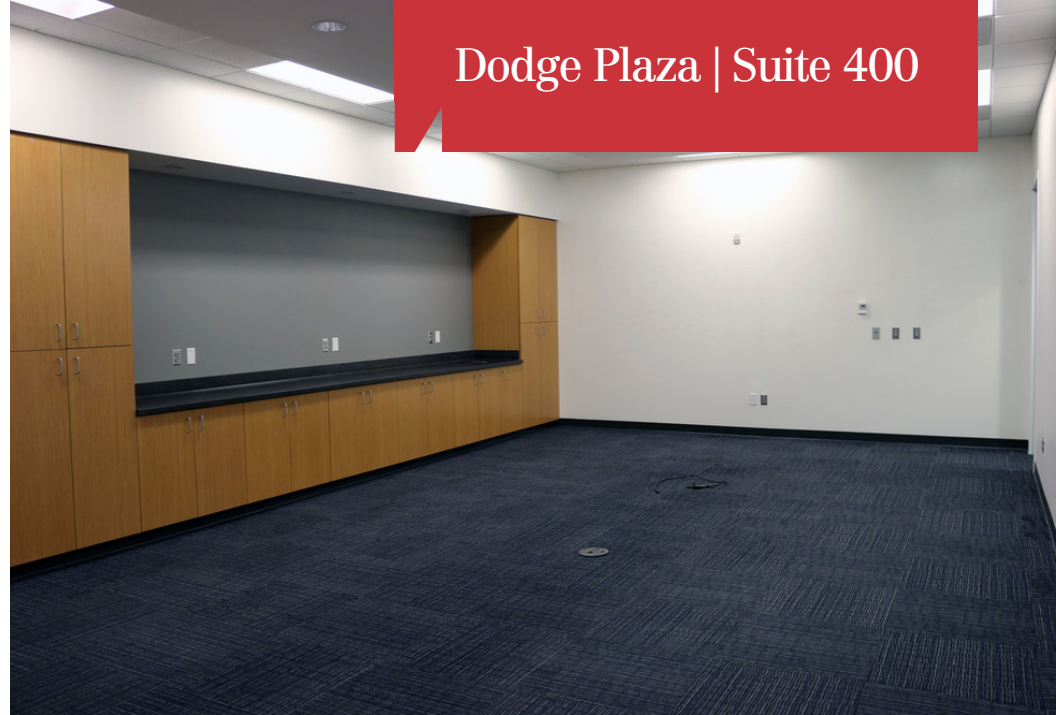
Dodge Plaza | Suite 400