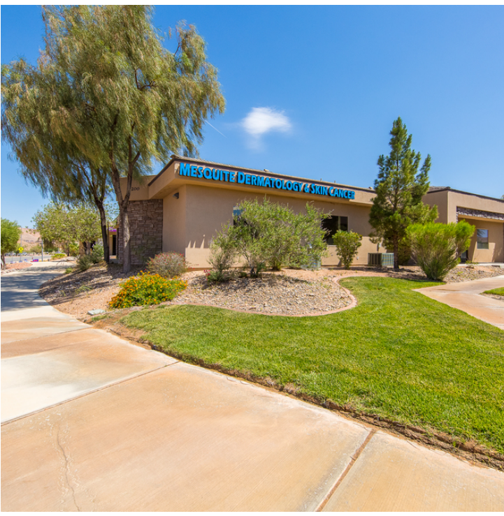
For More Information: