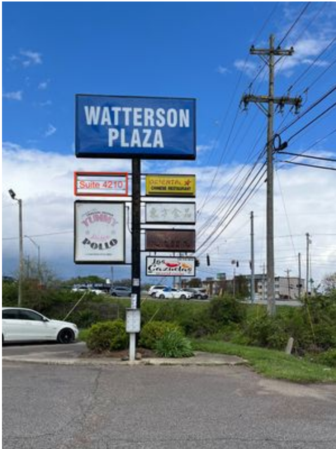
Watterson Plaza- Shared Monument Sign