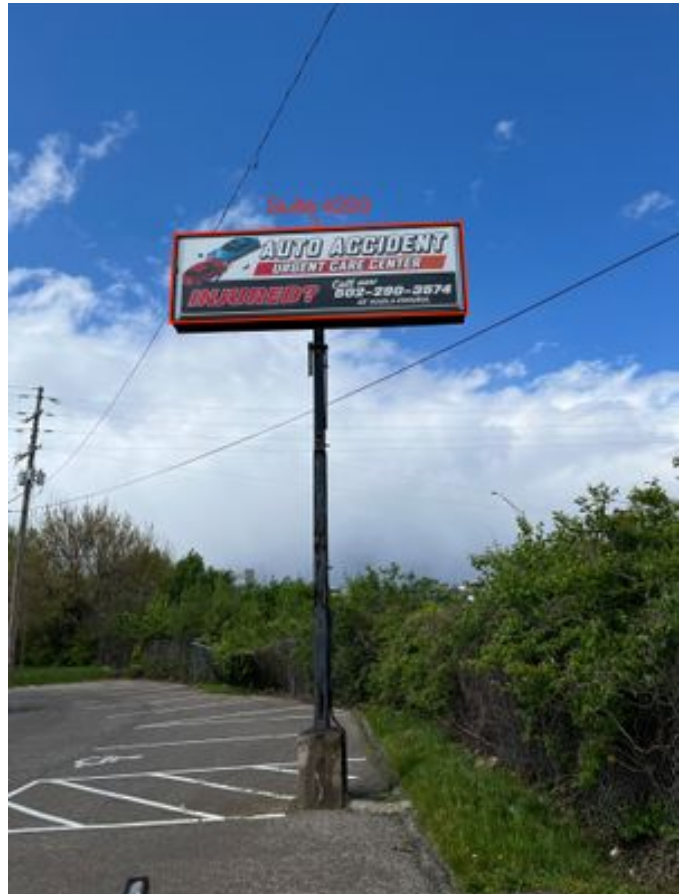
Watterson Plaza- Suite 4200- Pylon Sign