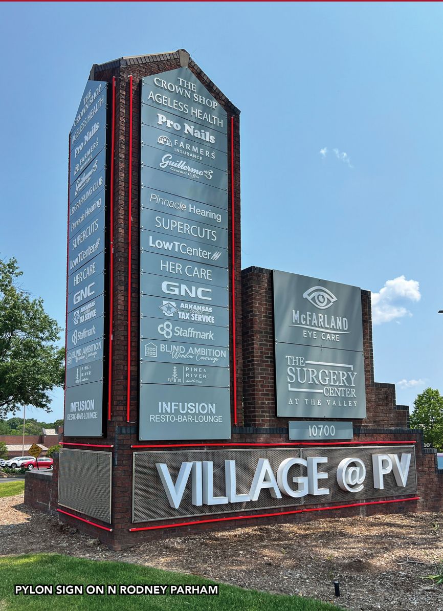
PYLON SIGN ON N RODNEY PARHAM

10700 N Rodney Parham Rd | Little Rock, AR