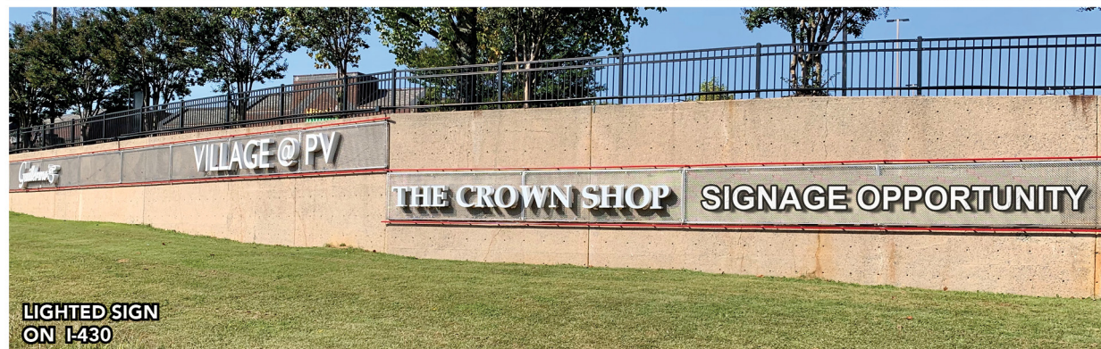
LIGHTED SIGN ON I-430