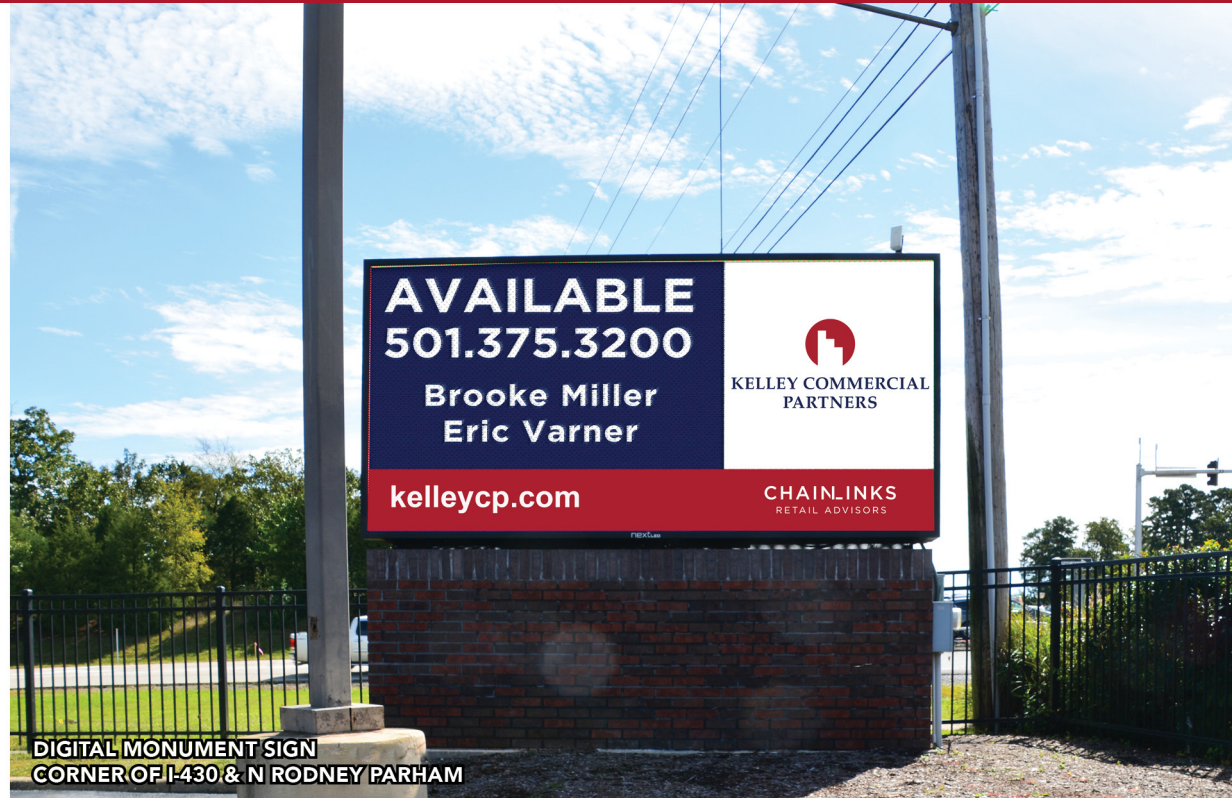
DIGITAL MONUMENT SIGN CORNER OF I-430 & N RODNEY PARHAM