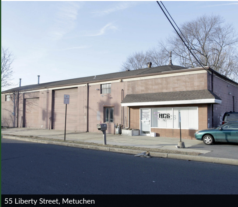
55 Liberty Street, Metuchen