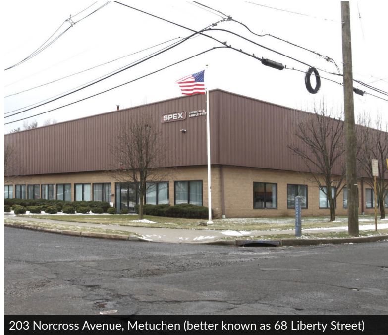
203 Norcross Avenue, Metuchen (better known as 68 Liberty Street)