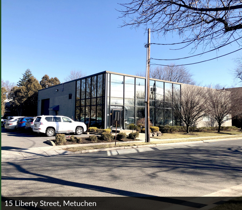
15 Liberty Street, Metuchen