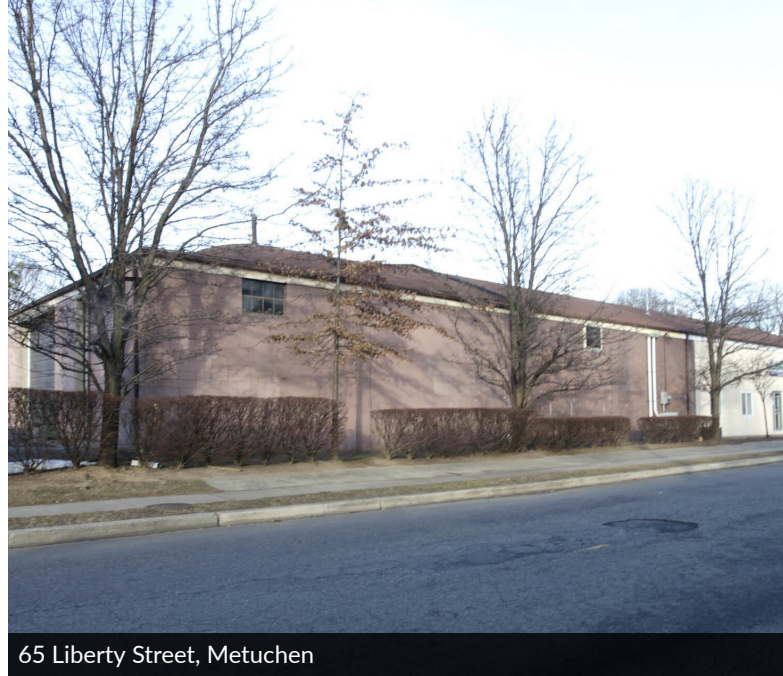
65 Liberty Street, Metuchen