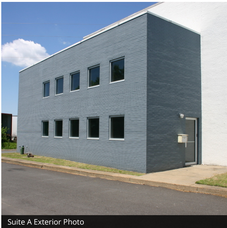
Suite A Exterior Photo