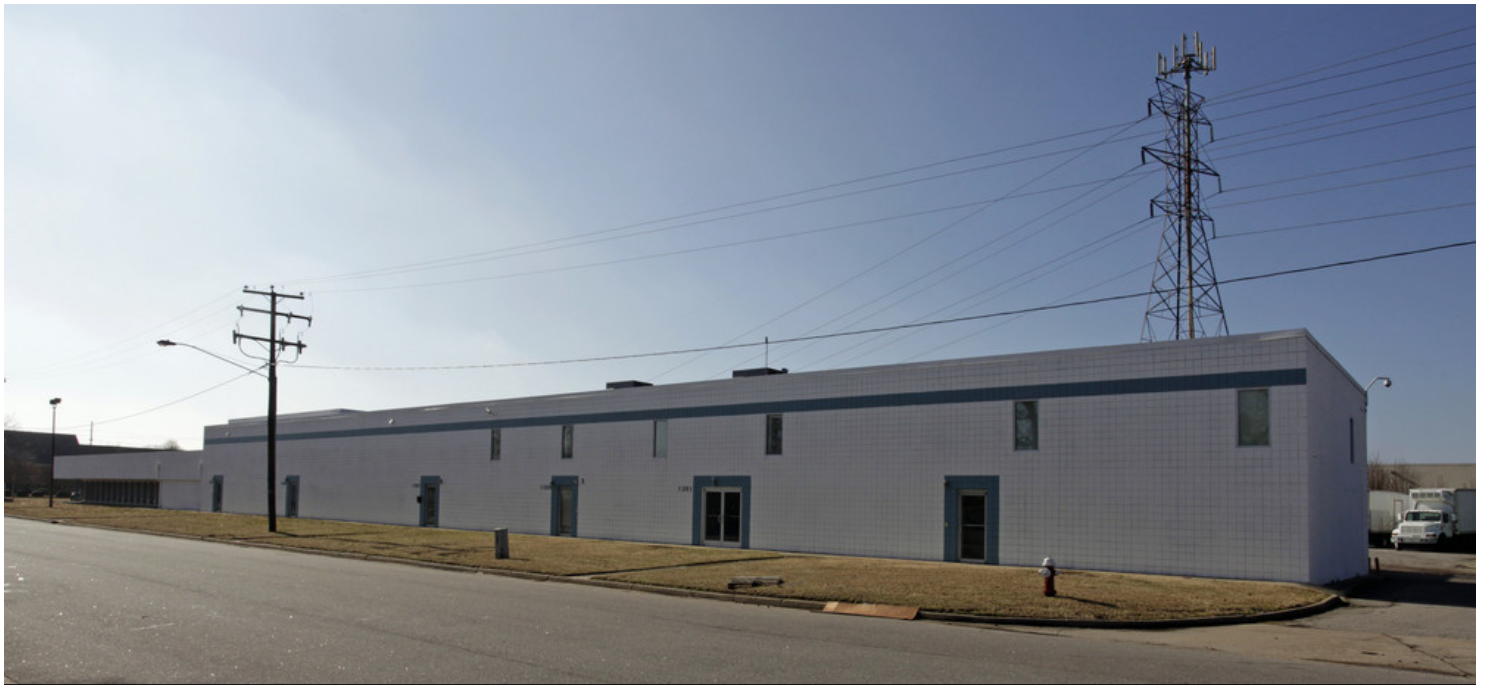
Front of Building Photo