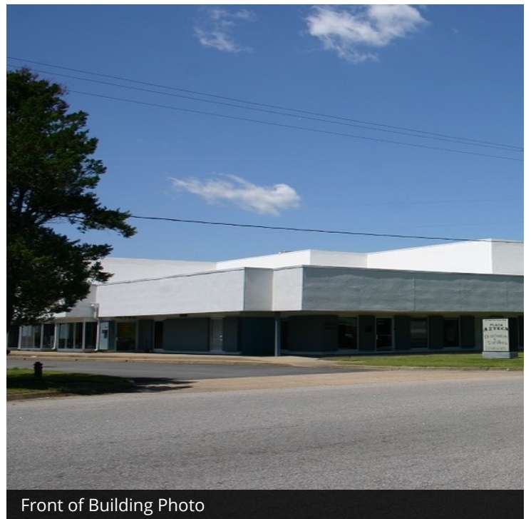
Front of Building Photo