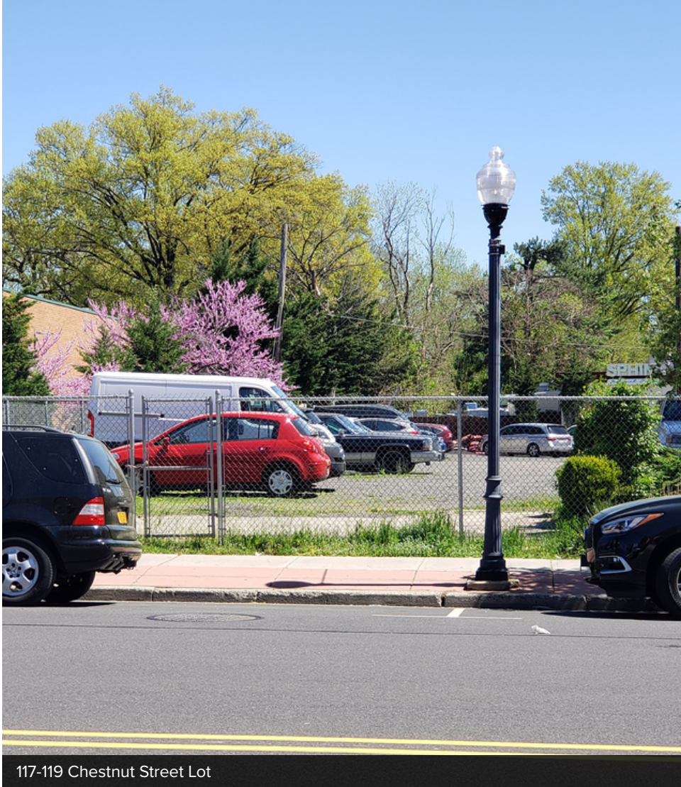
117-119 Chestnut Street Lot