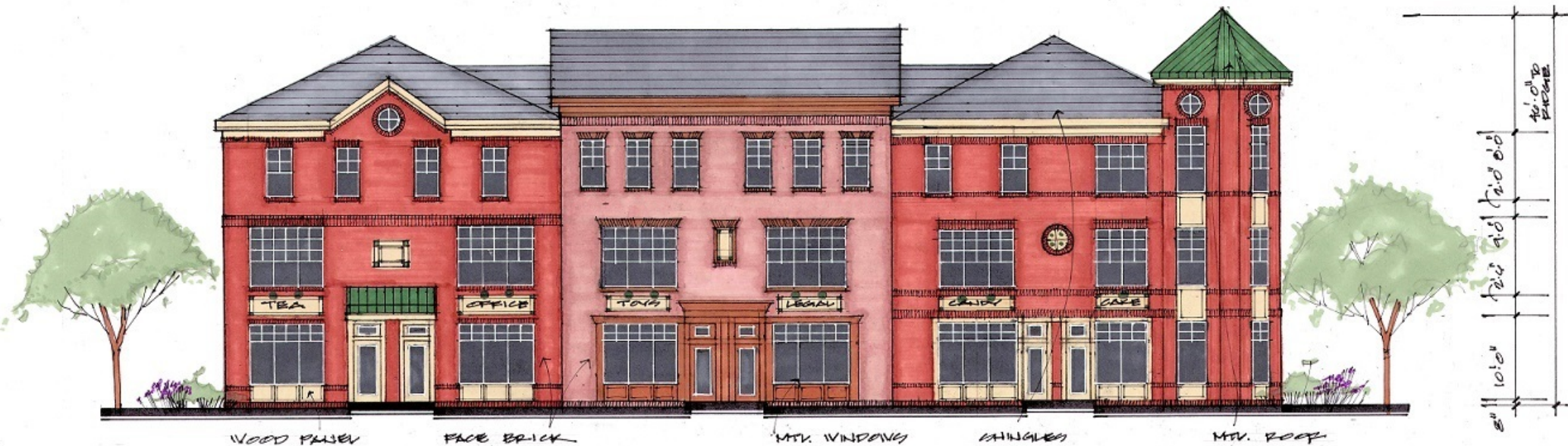
280/290 SOUTH STATE STREET BLDG A - SOUTH STATE STREET ELEVATION.