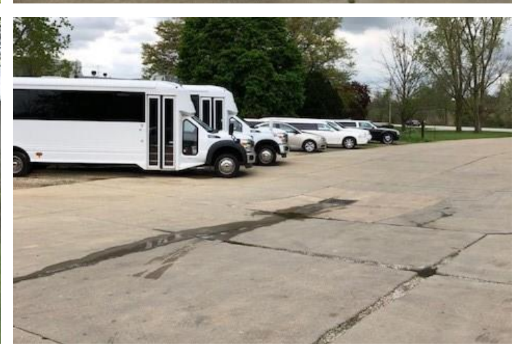
KW COMMERCIAL 2425 Medina Road Medina, OH 44256